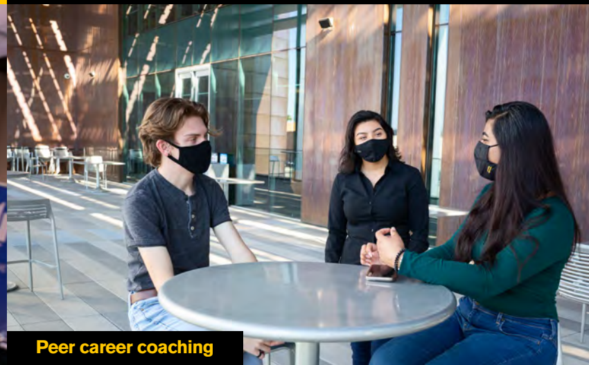
Peer career coaching